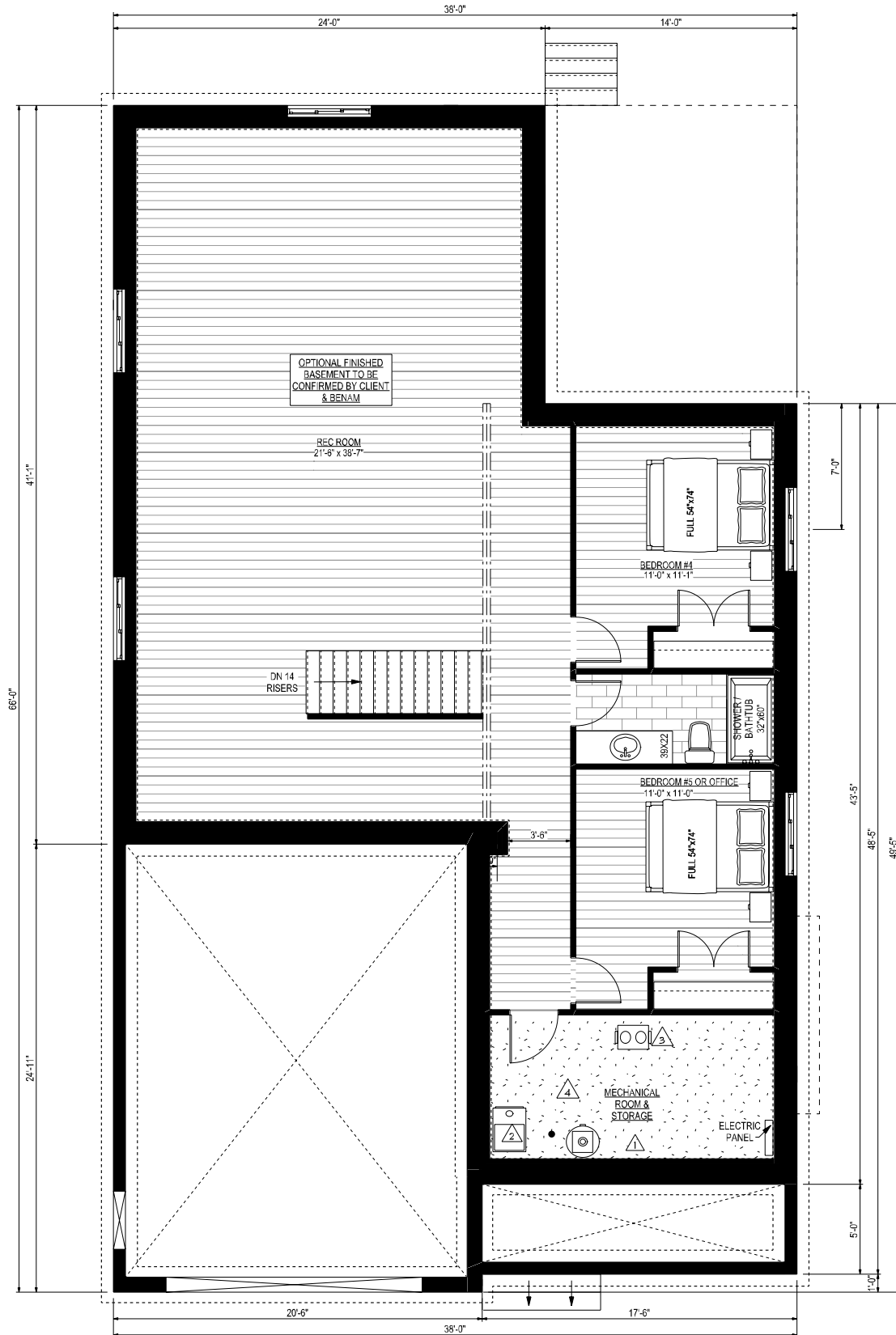
FOUNDATION / BASEMENT PLAN